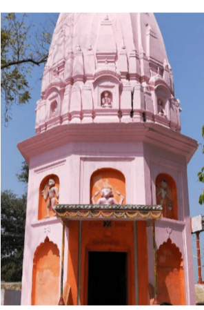
symbolizing the triumph of light and dharma.

portion, Queen Kaikeyi half of the remaining, and Queen Sumitra, received her own share, and also a portion from Queen Kaushalya. This led to the divine births of Lord Rama, (to Kaushalya) Bharata, (to Kaikeyi) Lakshmana, and Shatrughna, to Sumitra, thus fulfilling the celestial prophecy.